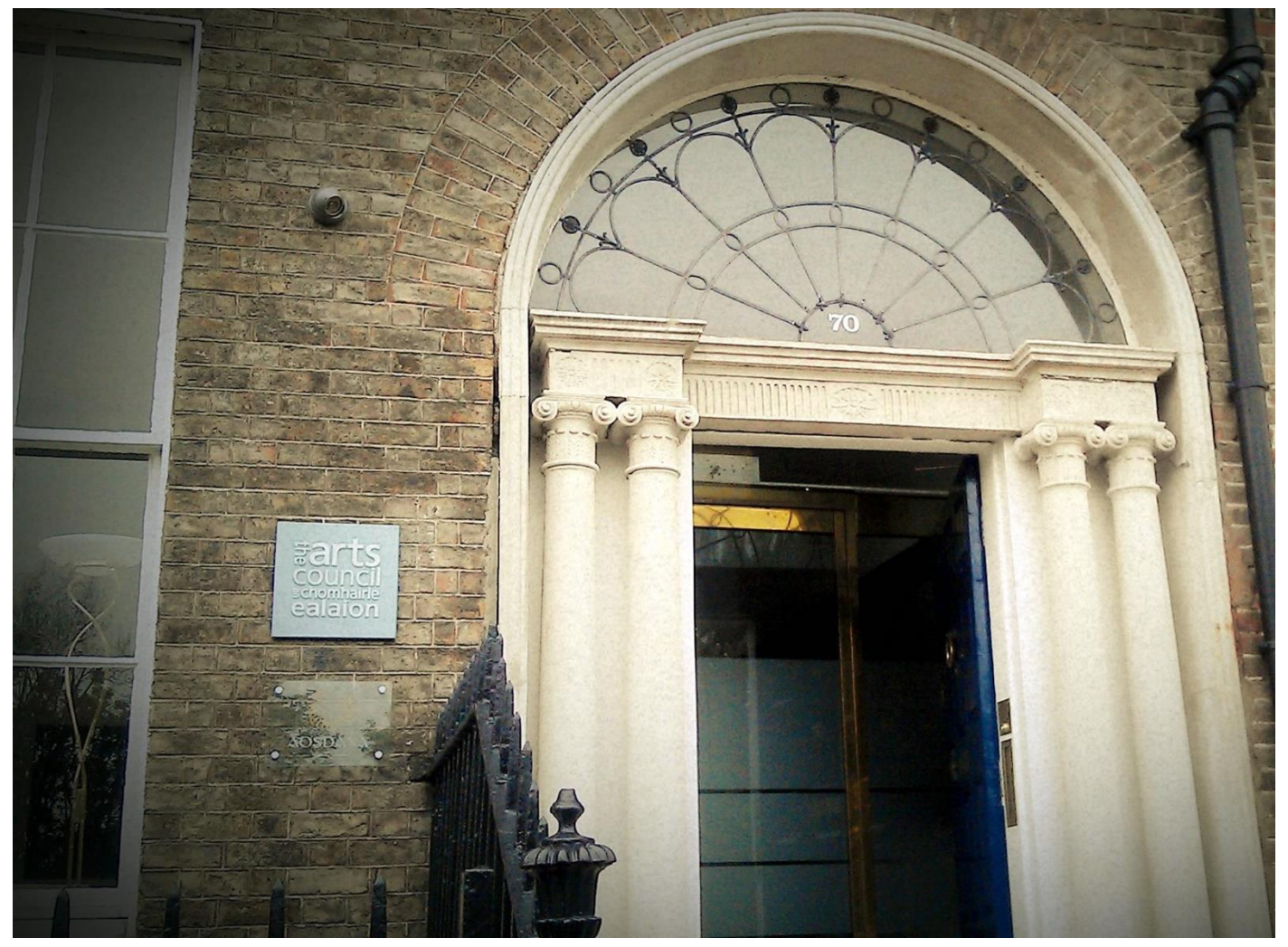
Arts Council premises on Merrion Square, Dublin

The Arts Council has announced that it is seeking a new Head of Music and Opera. The role is a full-time position managing some of the largest funding relationships in the Council's portfolio.